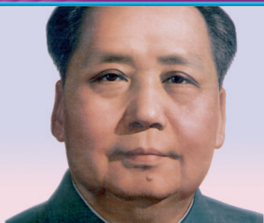
Mao Zedong 1893–1976

Born into a peasant family, Mao embraced Marxist socialism as a young man. Though he began as an urban labor organizer, Mao quickly realized the revolutionary potential of China's peasants. In 1927, Mao predicted: